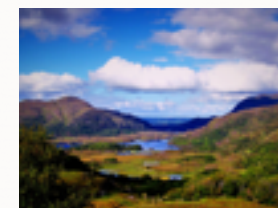
Looking north towards the lower lake and Killarney

South and west of Killarney in Co. Kerry is an expanse of rugged mountainous country. The McGillicuddy's Reeks, the highest mountain range in Ireland, rise to a height of over 1000m. At the foot of these mountains nestle the world famous lakes of Killarney. Here where the mountains sweep down to the lake shores, their lower slopes covered in woodlands, lies the 26,000 acre Killarney National Park. The distinctive combination of mountains, lakes, woods and waterfalls under ever changing skies gives the area a special scenic beauty.