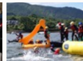
Star Outdoors Water Sports Centre in Kenmare