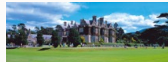
Muckross House and Gardens, are immediately accessible on entrance to the National Park, near the Venture Centre.