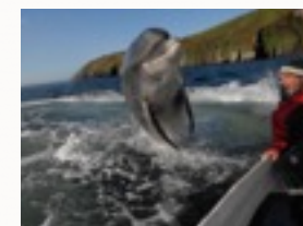
The famous Dingle Dolphin "Fungie" is a must see visit.

There are many and varied things to do: water sports, hiking, walking, team building, cycling, nature trails, sailing, visits to ancient sites and of course the famous Ring of Kerry Coach Tour. Probably more than you'll fit into your programme. If you have specific requirements and wish to be guided as to what is available please contact the Tourist Centre on Beech Road, Killarney, Kerry, +353 (0)64 6631633, killarneytio@failteireland.ie .