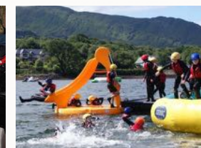
Star Outdoors Water Sports Centre in Kenmare