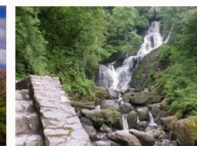
Torc Waterfall from the viewing point