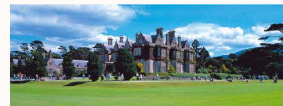
Muckross House and Gardens, are immediately accessible on entrance to the National Park, near the Venture Centre.