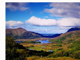
Looking north towards the lower lake and Killarney

South and west of Killarney in Co. Kerry is an expanse of rugged mountainous country. The McGillicuddy's Reeks, the highest mountain range in Ireland, rise to a height of over 1000m. At the foot of these mountains nestle the world famous lakes of Killarney. Here where the mountains sweep down to the lake shores, their lower slopes covered in woodlands, lies the 26,000 acre Killarney National Park. The distinctive combination of mountains, lakes, woods and waterfalls under ever changing skies gives the area a special scenic beauty.