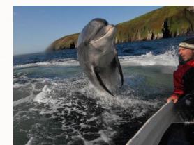
The famous Dingle Dolphin "Fungie" is a must see visit.

There are many and varied things to do: water sports, hiking, walking, team building, cycling, nature trails, sailing, visits to ancient sites and of course the famous Ring of Kerry Coach Tour. Probably more than you'll fit into your programme. If you have specific requirements and wish to be guided as to what is available please contact the Tourist Centre on Beech Road, Killarney, Kerry, +353 (0)64 6631633, killarneytio@failteireland.ie .